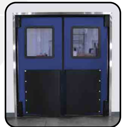
Shown in Canyon Blue w/ 36" bumpers