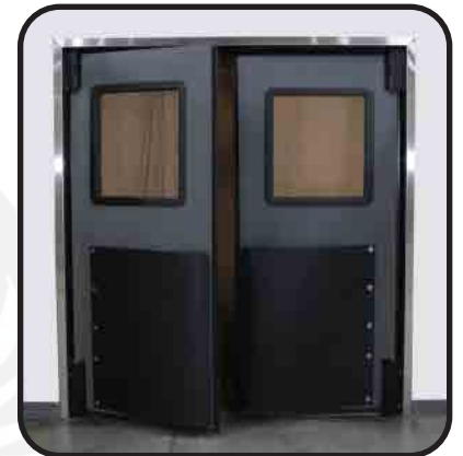
Shown in Metallic Gray w/ 36" bumpers