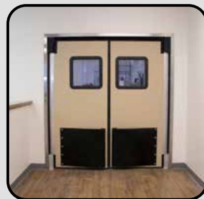
Shown in Beige w/ 24" bumpers