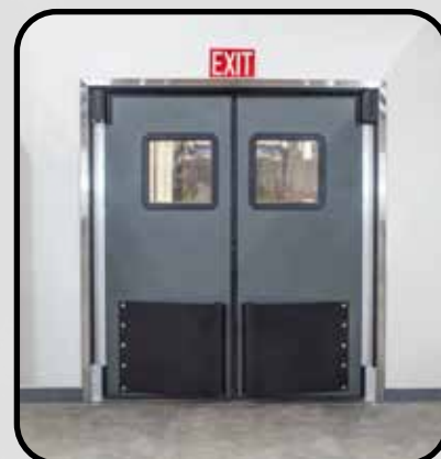
Shown in Metallic Gray w/ 24" bumpers