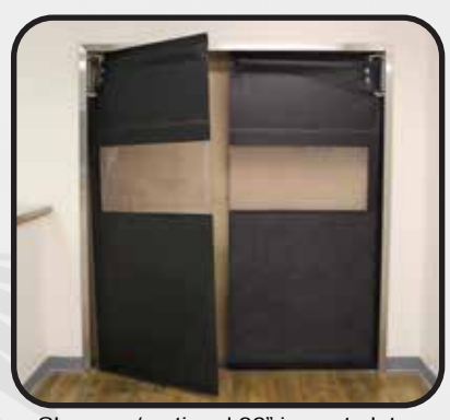
Shown w/ optional 36" impact plates