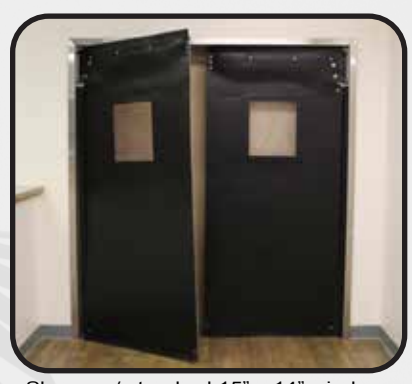
Shown w/ standard 15" x 14" windows