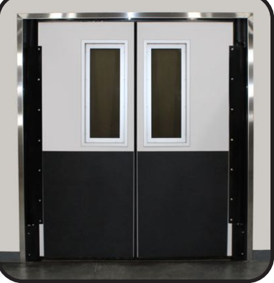
Shown in White w/ 36" kick plates