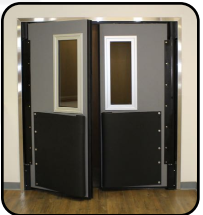
Shows dual blade gaskets on leading edge